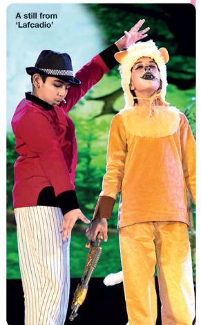
A still from 'Lafcadio'