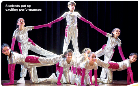
Students put up exciting performances