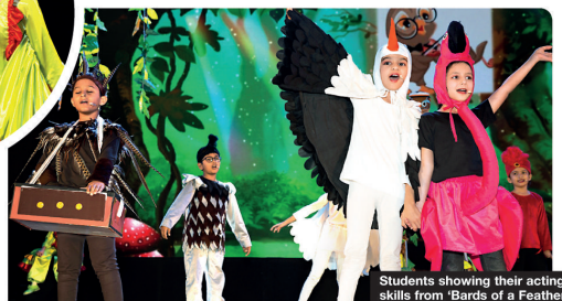
Students showing their acting skills from 'Bards of a Feather'