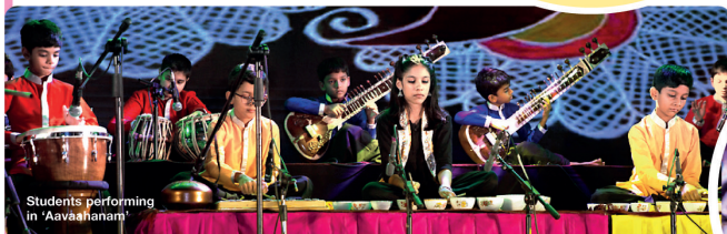
Students performing in 'Aavaahanam'