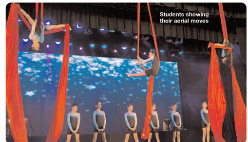
Students showing their aerial moves