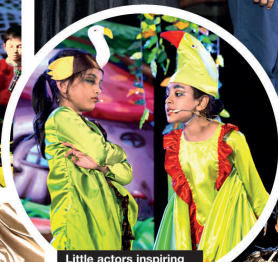
Little actors inspiring the audience