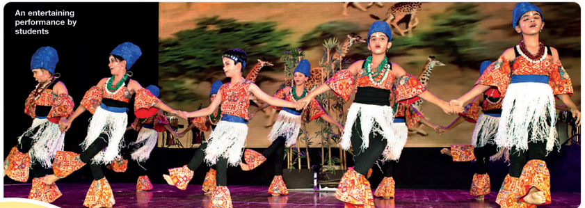
An entertaining performance by students