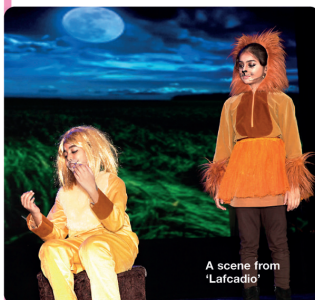
A scene from 'Lafcadio'