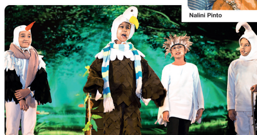
A scene from 'Bards of a Feather'