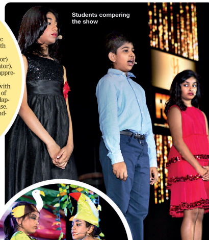
Students compering the show